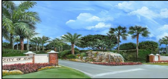
by Sandy Thompson (313-1060)

FOR THE LATEST CITY NEWS GO TO: www.atlantisfl.gov